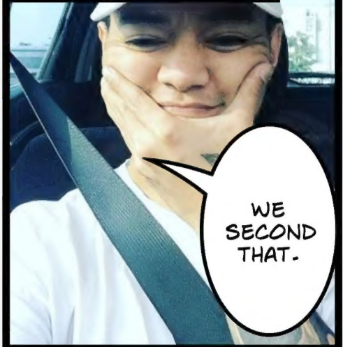
MEANWHILE AT ANONYMOUS INDONESIA HQ---